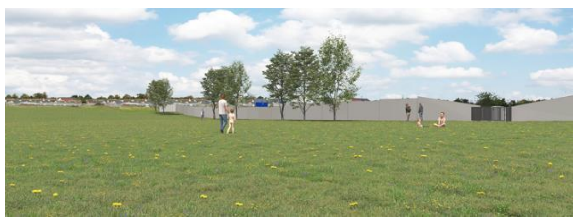
Proposed re-landscaping of Belcamp Park

Information leaflets describing the proposed scheme have been distributed to over 3000 local residents, with contact details for anyone seeking additional information. No requests for additional information were received. The Traveller Accommodation Unit have engaged with members of the local travelling community to discuss the works and agree the location of the pedestrian entrances, wall finishes etc.