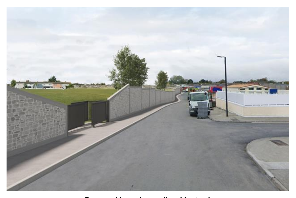
Proposed boundary wall and footpath