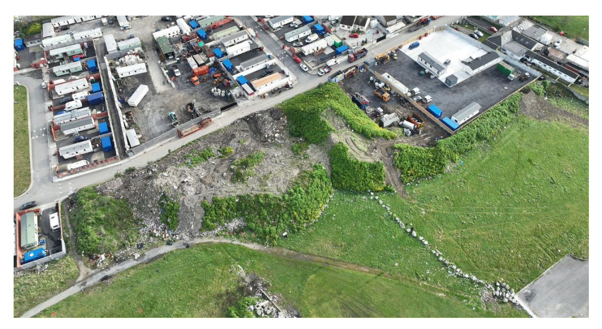
Existing illegal waste stockpile

The proposal involves the construction of a 2m wide concrete footpath and a 2.5m high boundary wall (approx. 120m in length) along the northern boundary of the green open space area of Belcamp Park (currently in part occupied by a stockpile largely comprised of illegal construction and demolition waste). The proposed boundary wall will be constructed of a precast reinforced concrete construction. Minor landscaping works will be undertaken in the grassed area.